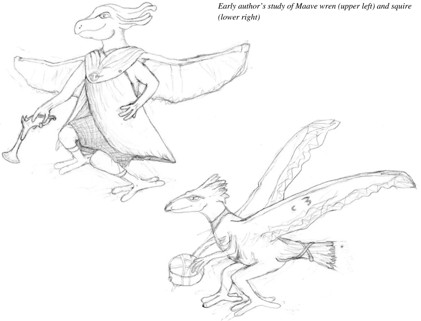
Early author's study of Maave wren (upper left) and squire (lower right)