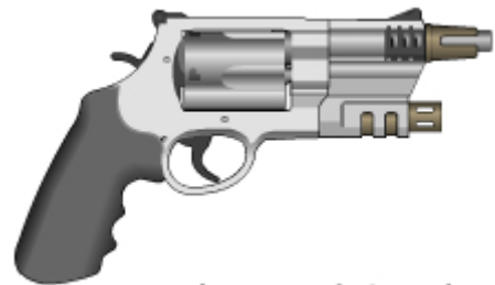
The CLC Revolver in Matte Black